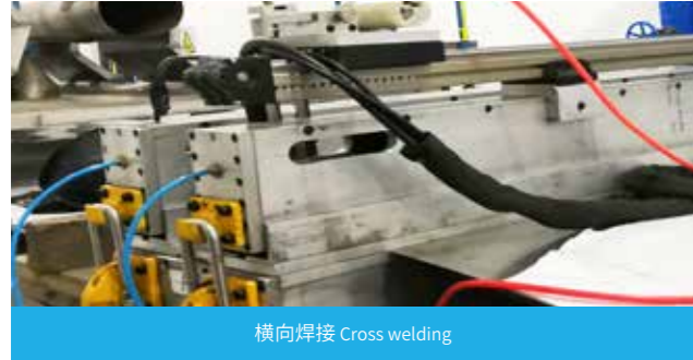
横向焊接 Cross welding