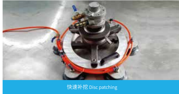
快速补挖 Disc patching