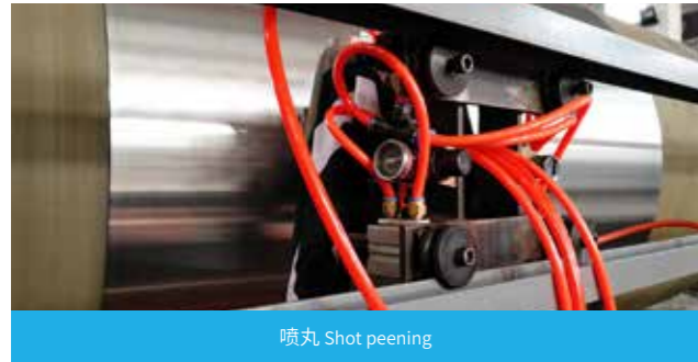
喷丸 Shot peening