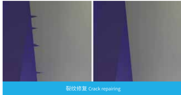
裂纹修复 Crack repairing